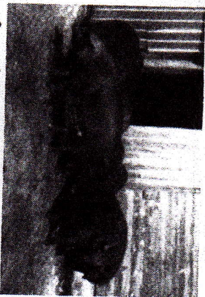
Group of gilts before farrowing (spring 1984) sired by Big Mac.