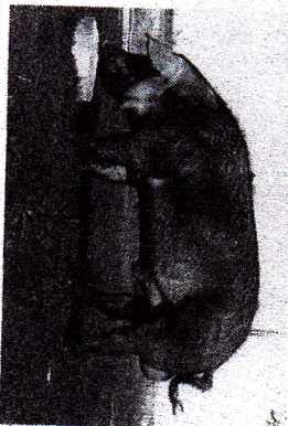
Wildman III at 1 year, son of Wildman II, Timberline-Wengler cross bloodline boar.