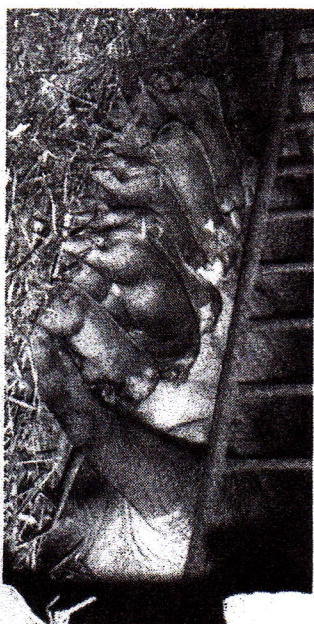
Sandy and her litter of 14 sired by Wolf, born in August of 1986.